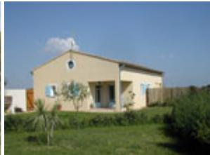
Mas des Cygnes

Two holiday cottages close to the sea in Aigues-Mortes (Camargue).