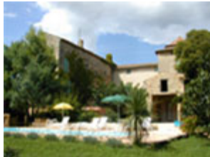
Domaine de Bercon

Three residences in a large Provencal house surrounded by vineyards in Bagnols-sur-Cèze.